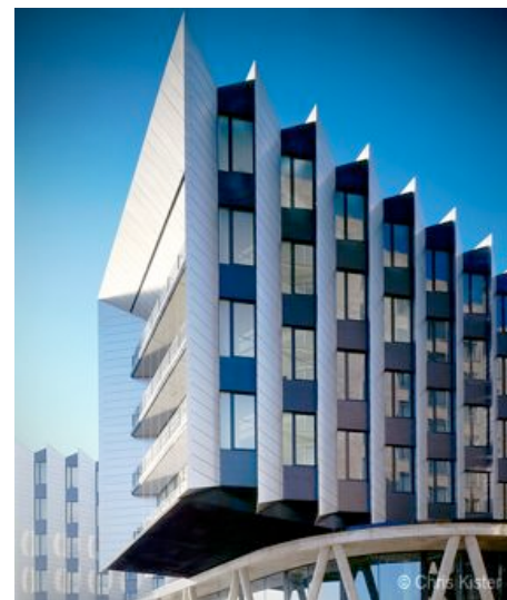
Wan-Ifra new office building located in Westhafen Pier, downtown Frankfurt.

In all these activities, we will ask for your support and contribution, as active members of our strategic governing bodies.