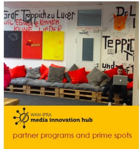
The media Innovation Hub facilitates and accelerates the digital transition of news by bridging research centres with publishers and suppliers. The International Alliance for Media Research and Innovation is the brain trust behind the Hub. For the first time ever, news media players, start-ups, and research centres from around the world are united in a combined effort to explore and foster the growth potential of R&D in news content creation, delivery and consumption. Too many organisations talk about innovation. WAN-IFRA makes it happen.

For a start, each research project went home with at least 20 contacts from people who signed a coupon stating that they "want to follow this research project". The cases were all concrete examples of Publisher/Academic collaboration.